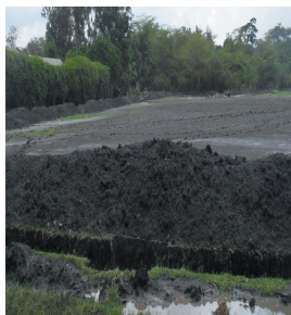
Playing ground which has been taken over by a developer