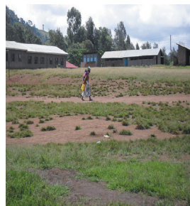
School play ground

Youth friendly health services were not mentioned at all. These are important because: